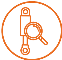
STRIPPING, ASSESSMENT AND PROPOSAL