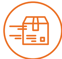
PACKAGING AND DELIVERY